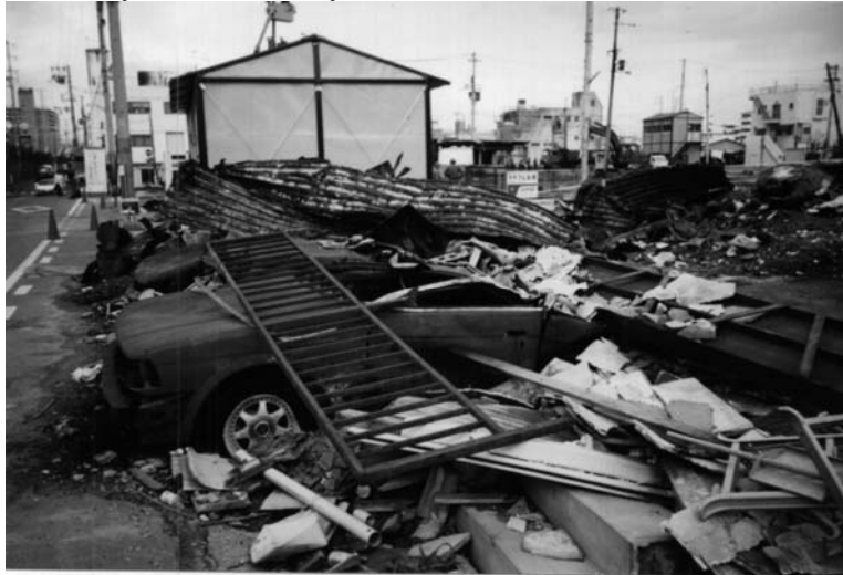
Kobe, Japan, after the earthquake