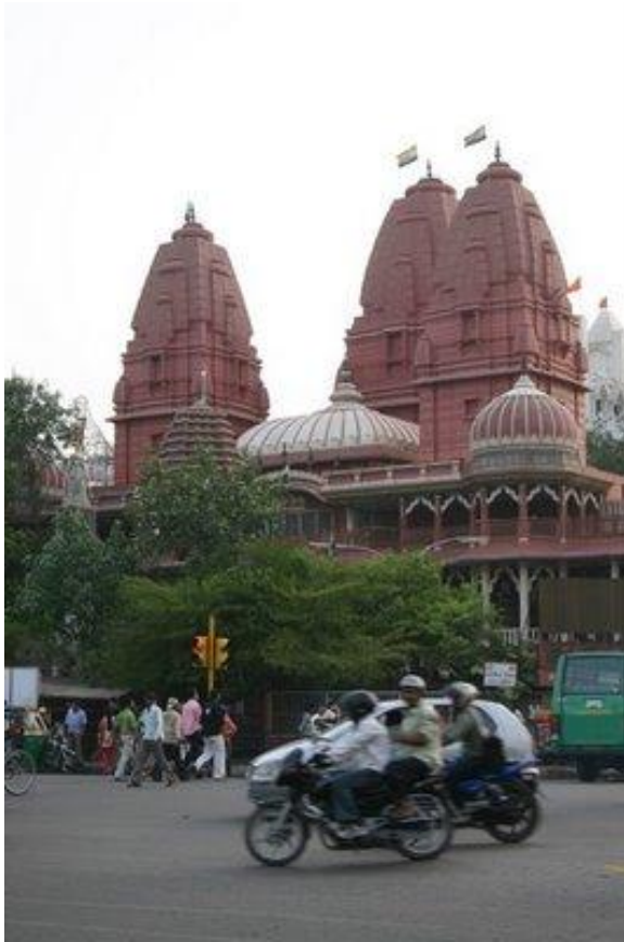
Above, left: Mandir is a Hindu temple. Cameras and bags are not allowed inside the building.