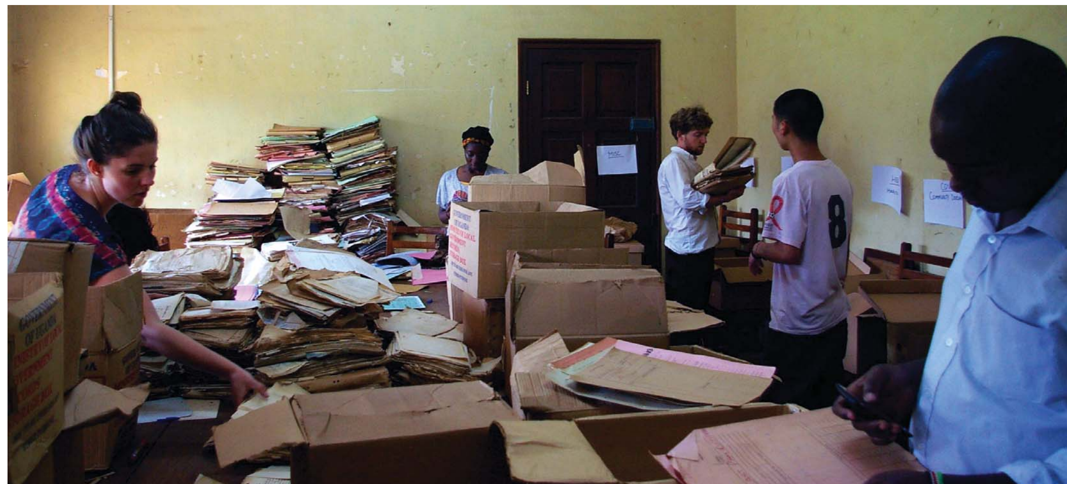
Jinja District Archives project team members sort through boxes of files.