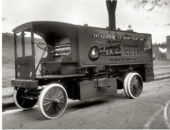
Walker Electric Ice Cream Delivery Truck - 1920

apparent. All of the squeaks and squabbles I had heard about the City of Detroit, its own overwhelmingly negative portrayals continuously called to light in the mainstream media, the disparaging remarks, hurtful stereotypes, and publicized sense of futility and despair lay themselves at my feet like a familiar welcome mat. This was a place I could get used to because in some ways, it was a place I had always known. I was elated!