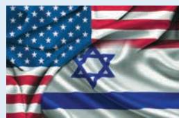
US Israel Flag Photo