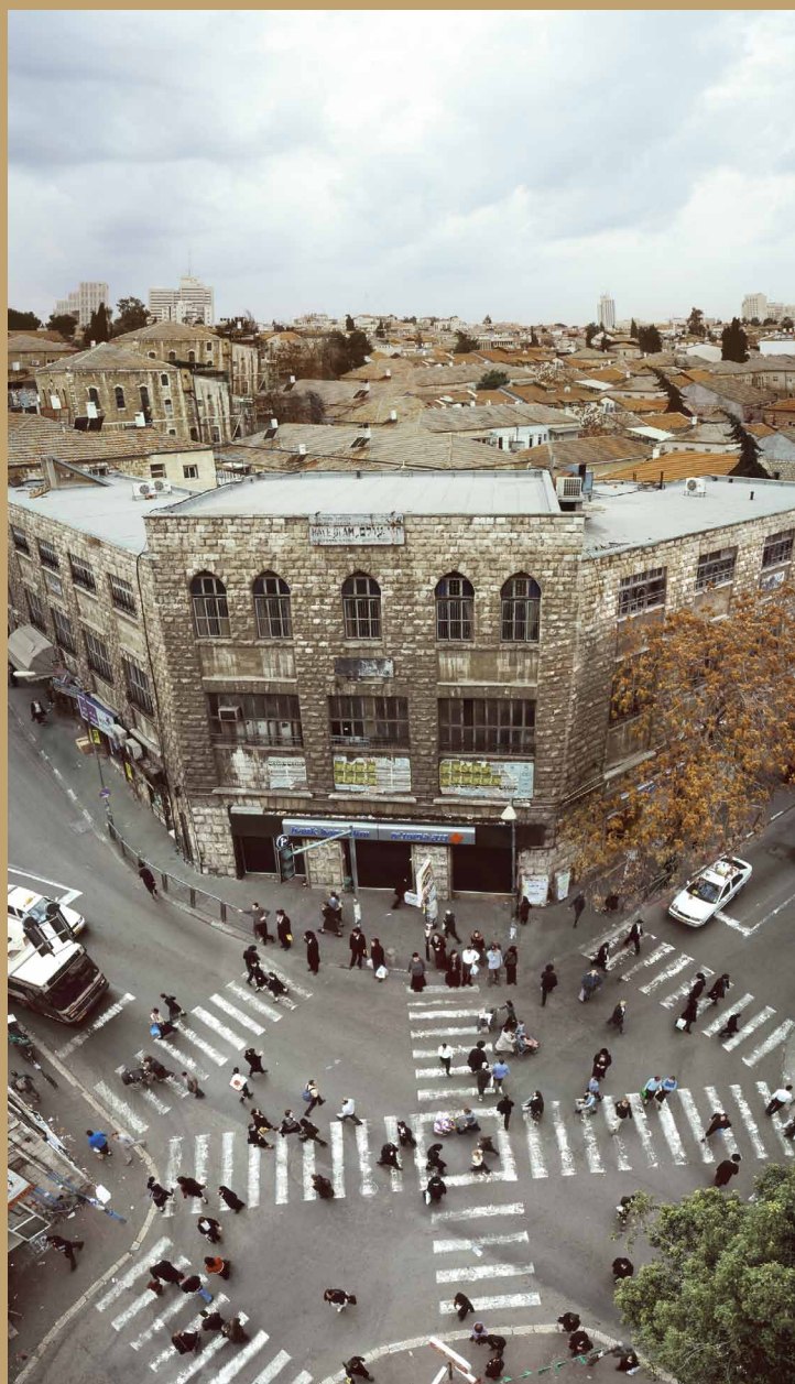
“Complex Projection #1: The Sabbath Square, 2003.” Photograph by Yigal Feliks.