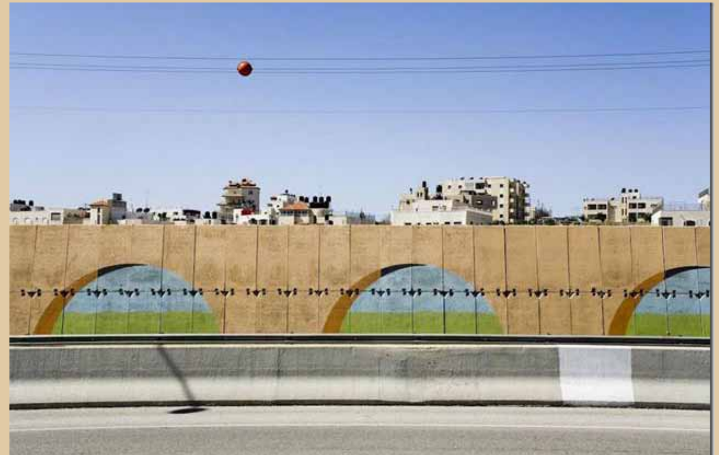
Bir Nabala, 2007.