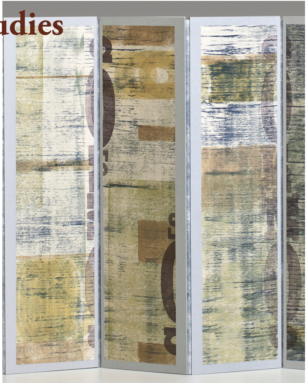
Lynne Avadenka. Fleeting Days II (2011). relief and letterpress printing, pochoir, folding screen.