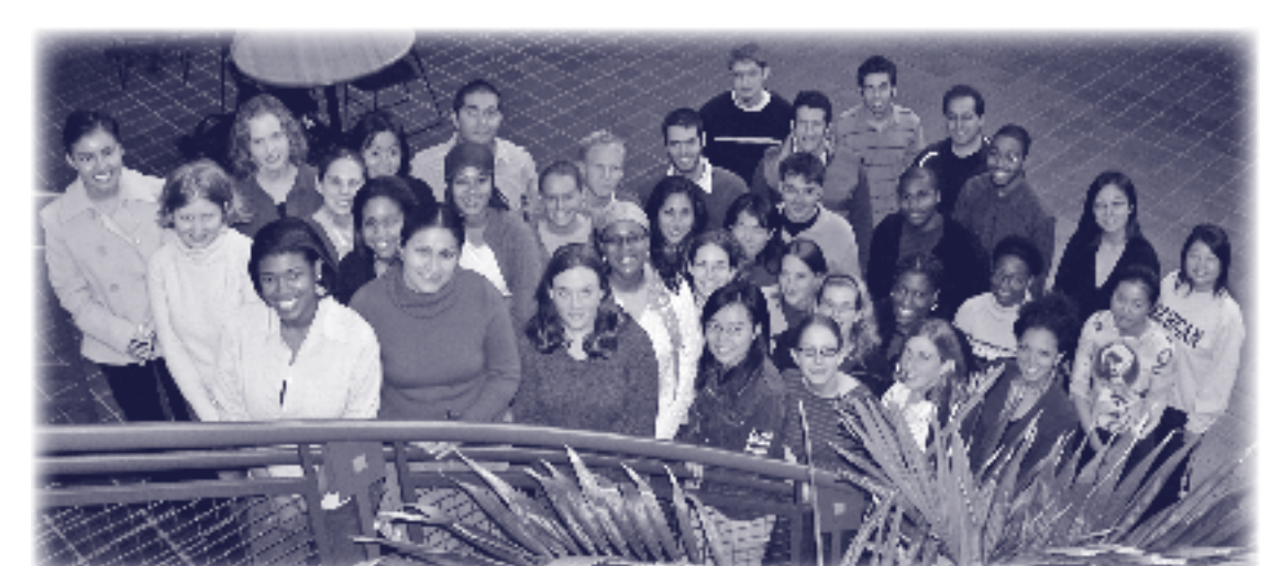
Members of the Graduate Student Cohort, September 2004