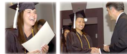
Opposite page and this page, right: Honors Graduation Ceremony.