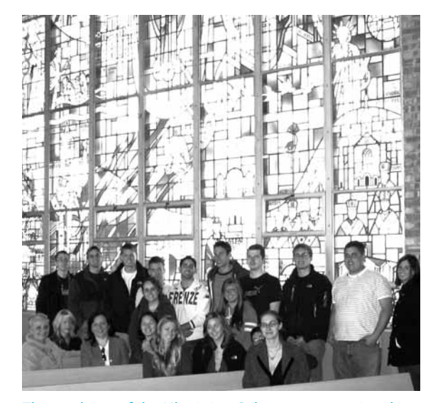
The students of the Ukrainian Culture course enjoy the stained glass at St. Josaphat Ukrainian Catholic Church in Warren, Ml. To visit their online community, point your browser to http://umichukrainian.blogspot.com/

As a requirement of the new mini-course "Introduction to Ukrainian Culture", 30 students participated in an online discussion blog. Here students posted their lecture related research, original thoughts and ideas, shared their experiences, discussed, commented, and responded to one others' postings. Many uploaded images, videos, and podcasts to illustrate their findings.