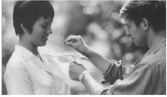
Two films— The Audition and Black Peter —by Miloš Forman concluded Czech Week