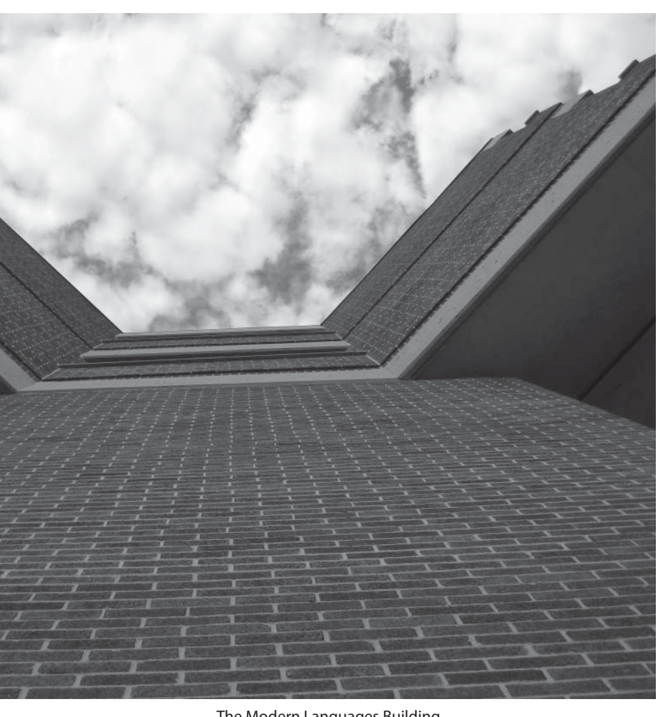
The Modern Languages Building