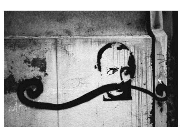
Street Graffiti art, Putin's gas, and Duchamp signature (Belgrade, Serbia, 2010)

Polish Film Festival [coming soon] www.annarborpolonia.org/filmfestival