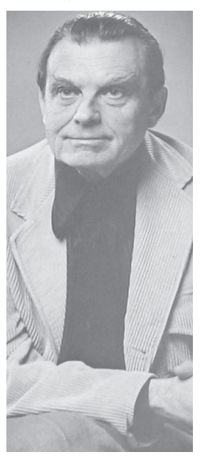
Image of Czesław Miłosz from his Utwory Poetyckie (1976), the first substantial collection of Miłosz's poems published in Polish.