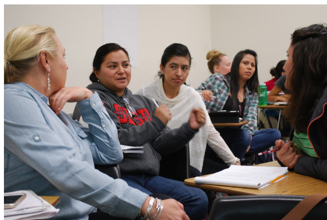
Teachers-to-be participate in a master’s seminar on their way to earning a bilingual certification from San Diego State University in San Diego, California.

Statewide however, experts say public opinion has begun to shift towards the idea that being multilingual could be an advantage. And though official numbers are hard to come by — California stopped