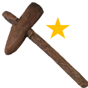
Check out this toy hammer and many other toys in the toy drawer!