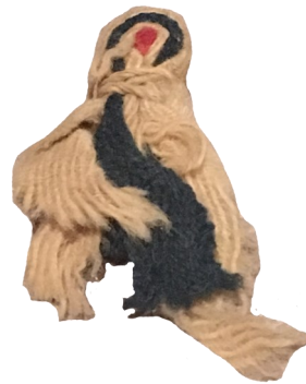
Is this a doll or a pacifier? What do you think?