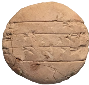
Kids in Mesopotamia learned to write on circular tablets like this.