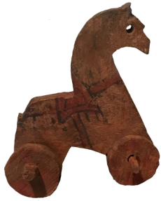
Pull toys that look like horses were popular in Karanis, Egypt. Some have brightly painted saddles.