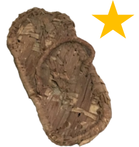
This sandal is a toddler size 9.5