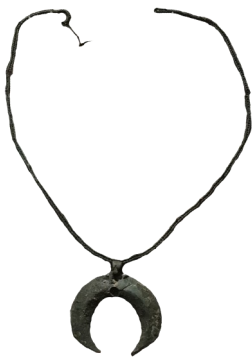
Roman girls wore protection amulets shaped like a crescent moon. This was called a lunulua (little moon).