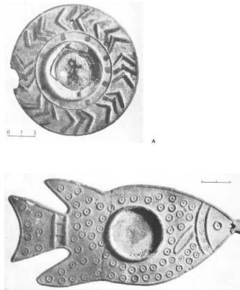
Figure 4: Two other examples of mirror plaques, taken from [3]. The top one is circular with one indent at its center and a suspension hole at the top. The bottom one is shaped like a fish with one circular recess at its center and a suspension hole at the mouth.

To exhibit this, two examples are shown in Figure 4. These shapes, ranging from fish and other zoomorphic designs to simple circles, are neither inherently nor obviously religious.