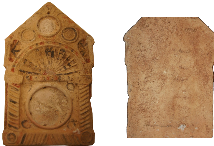
Figure 1: Pictures of the front and back of the mirror plaque, taken from [4]. The top of the object is truncated in the image on the right because of the picture. (I didn't break it.)

At this time, the region of Israel was under control of the Byzantine empire, the reign of which lasted from ca. 324 - 640 CE. Before the Byzantine era, the end of the Pax Romana in ca. 180 CE was marked by frequent Barbarian invasions, inflation and economic stability, and over 26 Roman emperors in only 50 years [4]. This crisis was one of the primary motivations that led people to abandon the old gods in search of new. The rise of Christianity after the Anarchy of the Third Century introduced a second major religion to the region—the first, of course, being Judaism. The Church of the Holy Sepulcher provided a sturdy foundation for the movement that would become the first official religion of the Roman empire; the famous Madaba map, conspicuously omitting the Temple Mount and centering Jerusalem about this church, symbolized the religious revolution. After the Byzantine era, the imposition of Islam in the seventh century CE brought a third major religion in the region of Israel/Palestine.