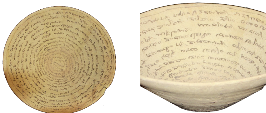
Figure 3: Pictures of two views of the bowl, taken from the Neareast 207 course website [4].

The object is made of clay with an Aramaic inscription that runs along the interior. It is medium-sized and easily held in two hands. The bowl is very well preserved with only minor chips and cracks along the outer rim and exterior. The inscription is easily readable, lacking any major smudges, gaps, or otherwise missing material. This artifact falls into a larger class