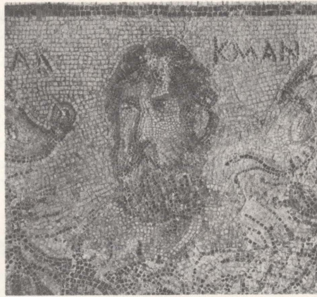
The Greek Lyric Poet Alcman Roman, Mid-2nd Century AC 874.1

The portrait of Alcman was originally one of a series of depictions of literary per-