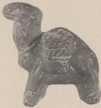
Ship of the Desert

In addition to the archaeological objects are actual examples of frankincense and myrrh, perhaps the most famous of all goods that passed along the Red Sea and