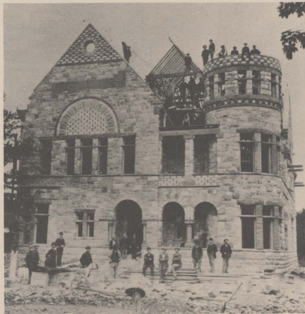
The Kelsey Under Construction, ca. 1890-91