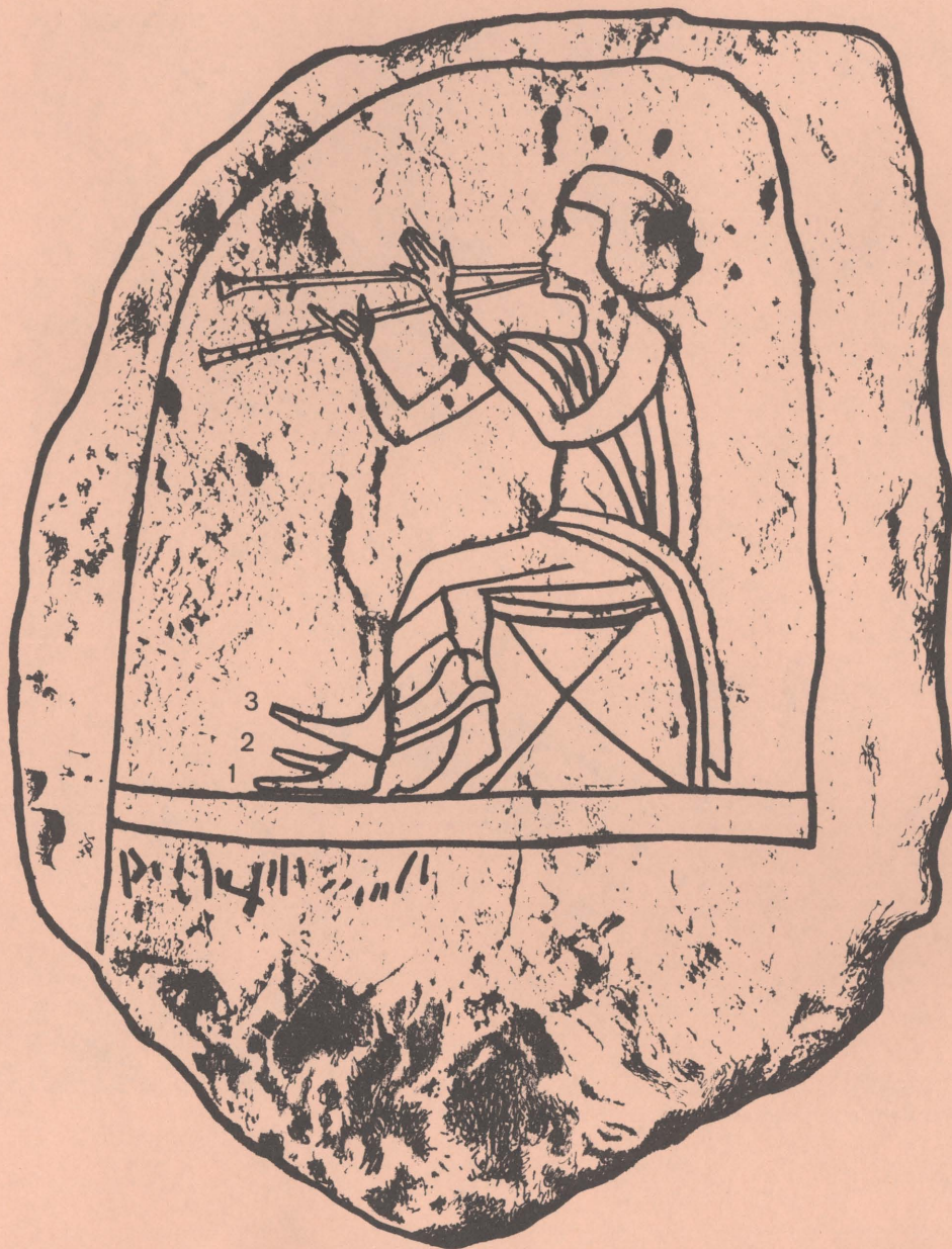
Schematic line drawing of Stele of Pareshy.

The second observation, and one of notable art-historical importance, concerns the positioning of the flautist's feet. In contrast to the ancient artistic prescription of feet flat on the ground, the engraver of this relief subject shows the musician's left foot (closest to the chair's diagonal brace) in a flexed position, with the ball of the foot acting as the weight-bearing fulcrum of the body's precarious balance. The placement and flexion of the left foot might also imply that the musician's torso swayed back and forth from the waist, requiring this foot as a stable pivot to respond to his shifting equilibrium.