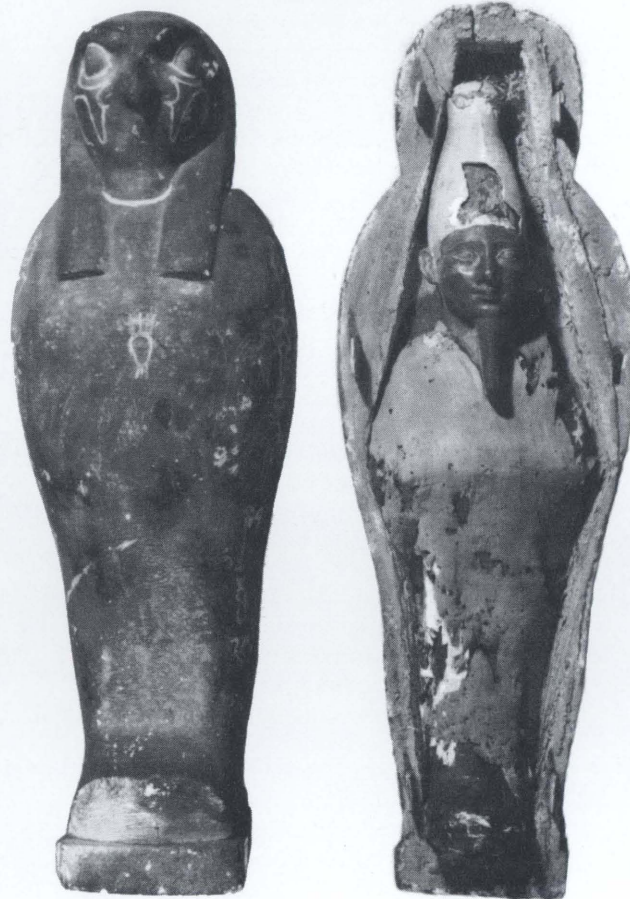
One of the most striking objects exhibited in "Death in Ancient Egypt" is this grain mummy of the god Osiris (right) in a wooden coffin with a falcon head (left), symbol of death and resurrection.

Various professional art, archaeological, and philological organizations will hold their annual meetings in the next few months. The Kelsey will be well