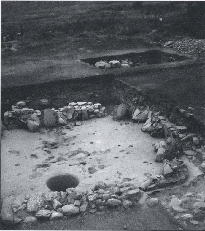
Site photo showing, in the foreground, the magazine containing large broken storage jars, or amphoras, which are visible around the walls of the room. In the background is the corner room where the bullae were found.

The team, consisting predominantly of students from both the University of Michigan and the University of Minnesota, was in the field from May 20 to July 18. We concentrated our efforts on the southern sector of the tel, where we opened large parts of five 10-by-10-meter excavation squares. We were also able to explore three other areas briefly.