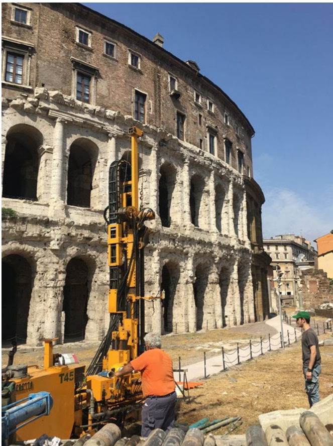
Drilling cores outside the Theater of Marcellus, Rome.

Despite Rome's long tradition of study, scholars actually know frustratingly little about the city's original setting and early history. In attempt to fill some of these gaps in historical knowledge, the Forum Boarium Coring Survey started in 2015 as a cross-disciplinary international project in collaboration with the Italian National Institute for Geophysics and Vulcanology, the 14 CHRONO Centre (Queen's University, Belfast), and the Department of Environmental Biology (University of Rome La Sapienza). A combination of environmental sampling, paleomagnetic analysis, palynology, and radiocarbon dates on twenty-two