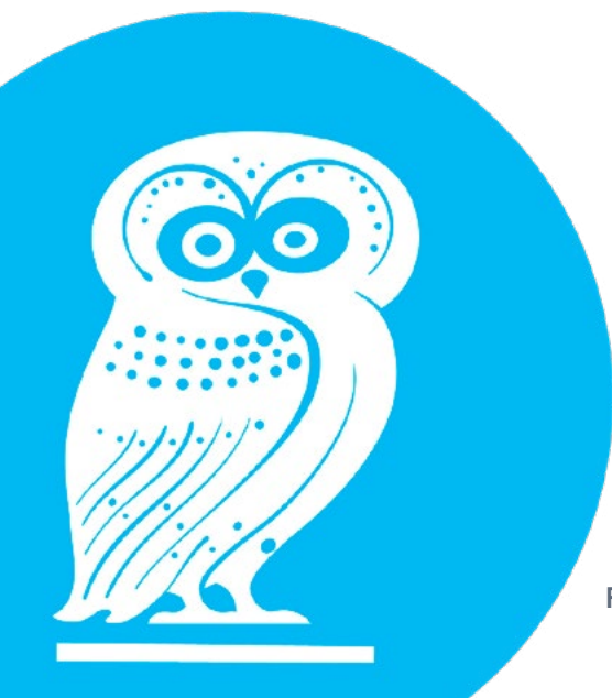
Figure 1. The new owl logo, designed by Eric Campbell.

Our owl cup originally comes from Greece. It is a type of pottery known as Attic red-figured ware, made of painted and fired clay. Each side shows a figure of an owl between olive branches, above a baseline. The Kelsey cup is a two-handled drinking vessel of a type known as a kotyle. There is a similar type of cup known as a skyphos (with a narrower base) that has a variant known as a glaux (literally "owl"), often decorated with owls and having both horizontal and vertical handles. The Kelsey cup is plainer and squatter in shape and not as elaborate as the skyphos or glaux. Like the others, it would have been used for drinking wine.