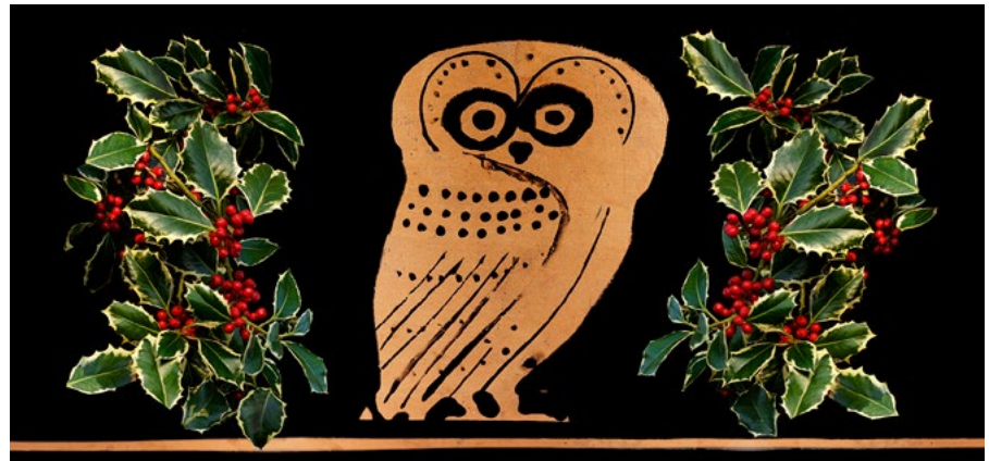
Figure 3. The owl flanked by holly sprigs on the 2017 holiday mailer. Art by Lorene Sterner.

for the association of the little owl with drinking cups is uncertain, but may reflect ideas of drinking wine bringing forth wisdom or truth, for good or ill.