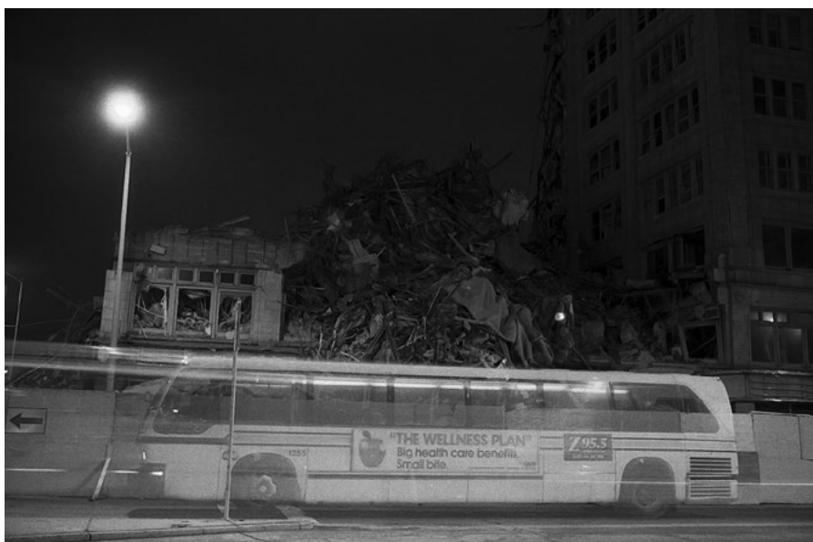
Figure 3. Wellness Bus, West Grand Boulevard, Detroit, 1988.