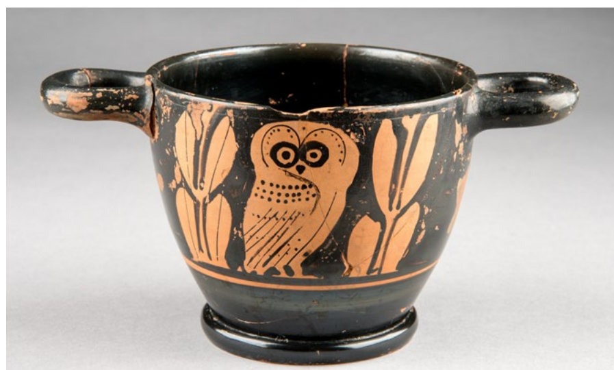
Figure 2. Red-figure kotyle (drinking cup), ca. 450–400 BCE. KM 2608.

The artifact from which the owl was taken is part of an important early