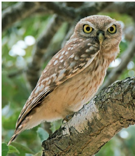
Figure 4. Little owl.

In the Classical world, the little owl is prominently associated with wisdom and knowledge, being the symbol of the Greek goddess Athena and the Roman goddess Minerva. Probably the best-known representations of the little owl from antiquity are from its appearance on Athenian silver tetradrachms of the fifth century BCE. This coin, with its representation of Athena on the obverse and her owl on the reverse, is one of the most famous coin types of the ancient world, of which the Kelsey has a number of examples (fig. 5). The precise reason