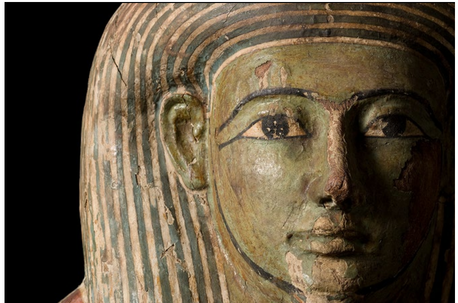
Figure 2. Coffin of Djehutmose: exterior of lid (KM 1989.3.1).

KM: What photographers and artists inspire you? What aspects of their work