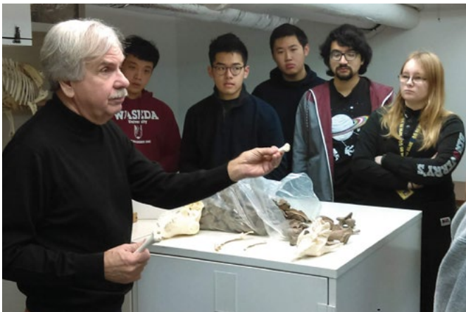
Teaching students in the Kelsey Museum's Bioarchaeology Lab.