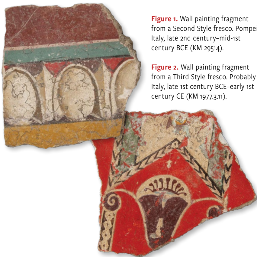
Figure 1. Wall painting fragment from a Second Style fresco. Pompeii, Italy, late 2nd century–mid-1st century BCE (KM 29514).

The new Kelsey Museum installation allows us to present the history of this medium of painting to visitors, including university students and K–12 groups encountering this material in their classes. It further allows us to take the strikingly colored, finely