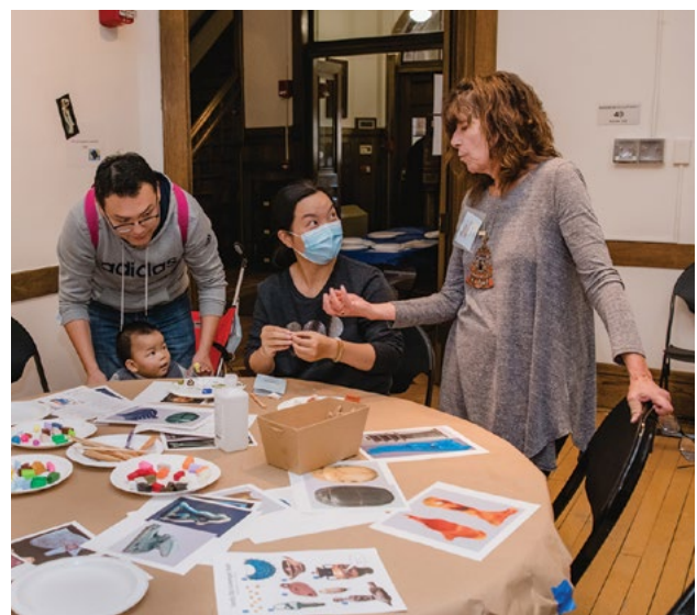
Kelsey Attendants assist with educational programming such as Family Day.

For more information and to apply to be a Kelsey Attendant, visit myumi.ch/dkzxq .