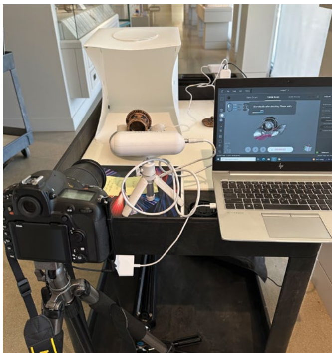
The Lizard set up to scan an artifact in the Kelsey's collection.