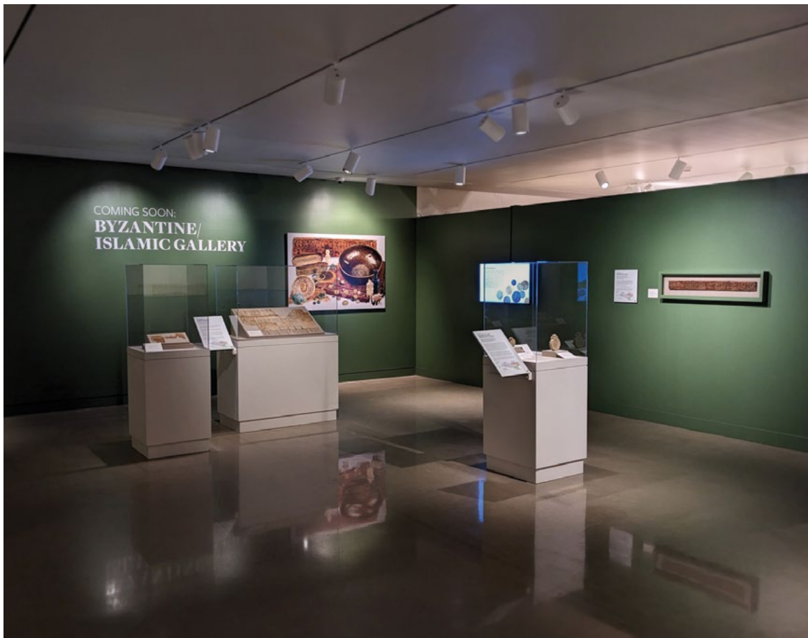
The first BIG Object Spotlight, featuring textiles, pilgrimage flasks, and a door lintel.

Curated by Christiane Gruber, BIG Object Spotlight #2 will be installed in late November and on view through early May 2024. This spotlight case will feature artifacts relating to bread, prayer and protection, and personal treasures, including wheat, bread stamps, bracelets, and amulets.