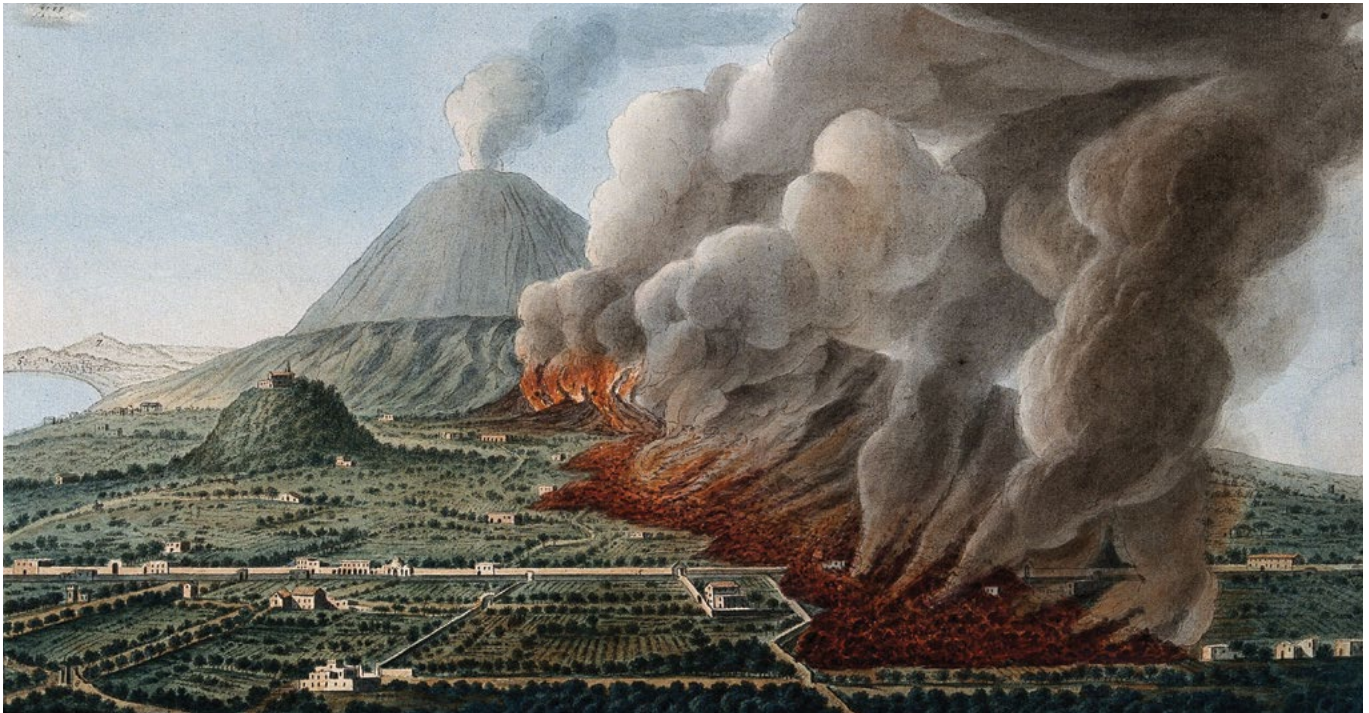
Figure 3. A colored etching depicting of an eruption of Mount Vesuvius. Pietro Fabris, 1776.

detailed fragments in our collection and imaginatively answer some of the questions they raise for visitors: What kind of walls did they come from? How big were these frescoes? What designs did they include? Were the details and patterns preserved on the fragments repeated, or were they surrounded by other motifs? What was it like to stand in a room decorated with such bold colors and rich designs and to live in a space like this?