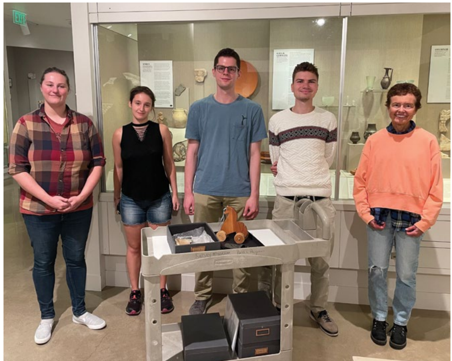
Interpreters stand with a Discovery Cart in the Kelsey's galleries.

The Discovery Carts were available within the Kelsey Museum's permanent galleries on Friday afternoons throughout most of the fall semester. In December, the Education Department will evaluate visitor attendance and engagement to determine whether Discovery Carts will become a permanent addition to the Kelsey's community programming.