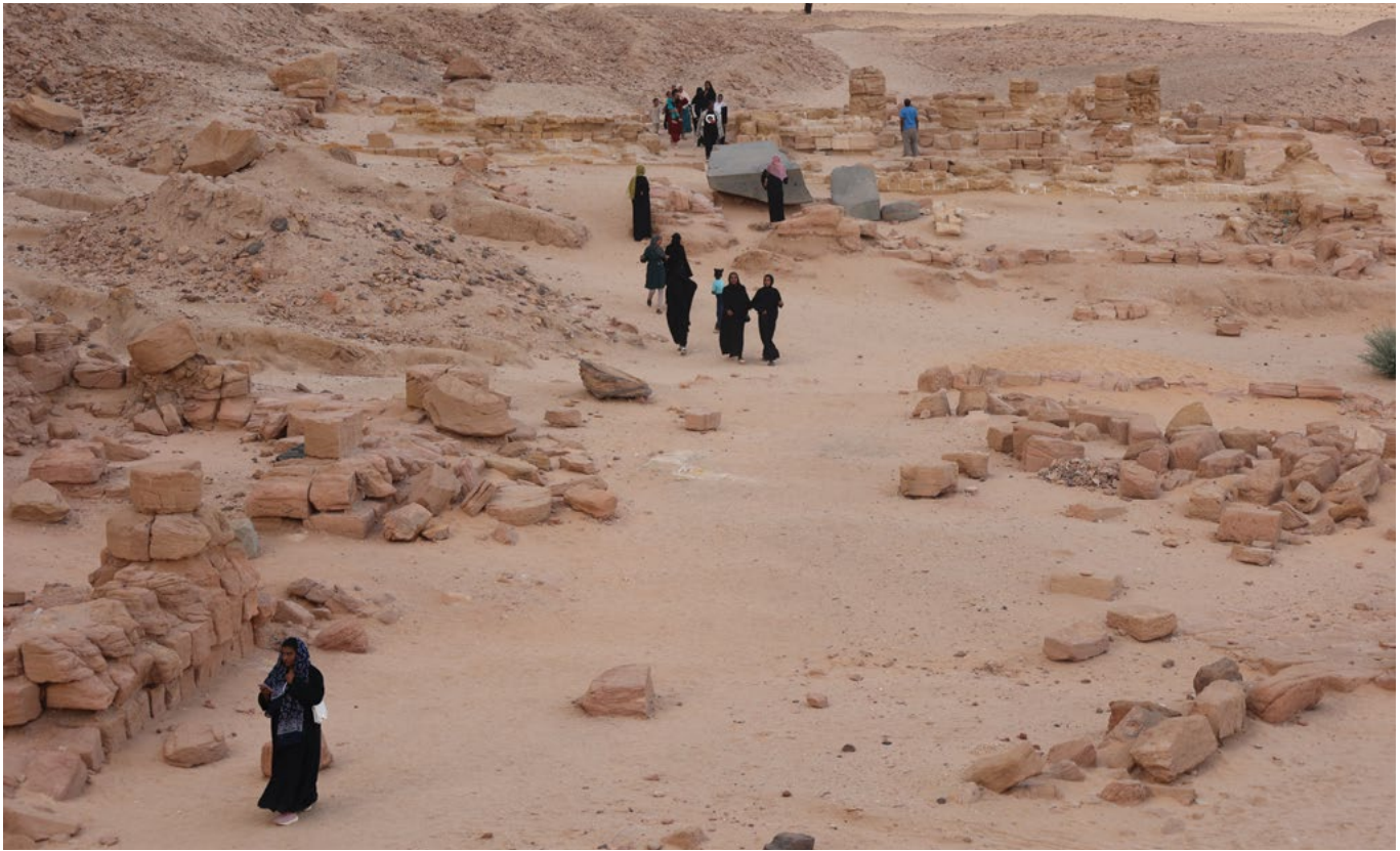
Figure 2. People touring the site of Jebel Barkal in May 2023.

to wonder what we could do to support our Sudanese colleagues and to protect and preserve the sites where we have all worked together. As it turns out, we have been able to do a lot.