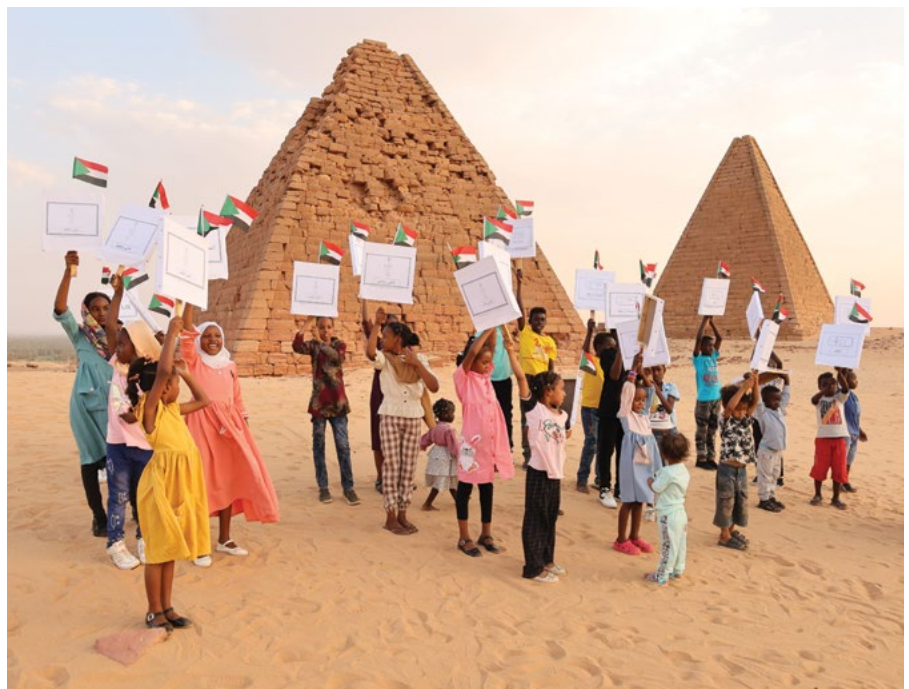
Figure 4. Children holding hieroglyphics worksheets and the Sudanese flag at the Jebel Barkal pyramids.

For more information and updates on the Jebel Barkal Archaeological Project, visit sites.lsa.umich.edu/jbap .