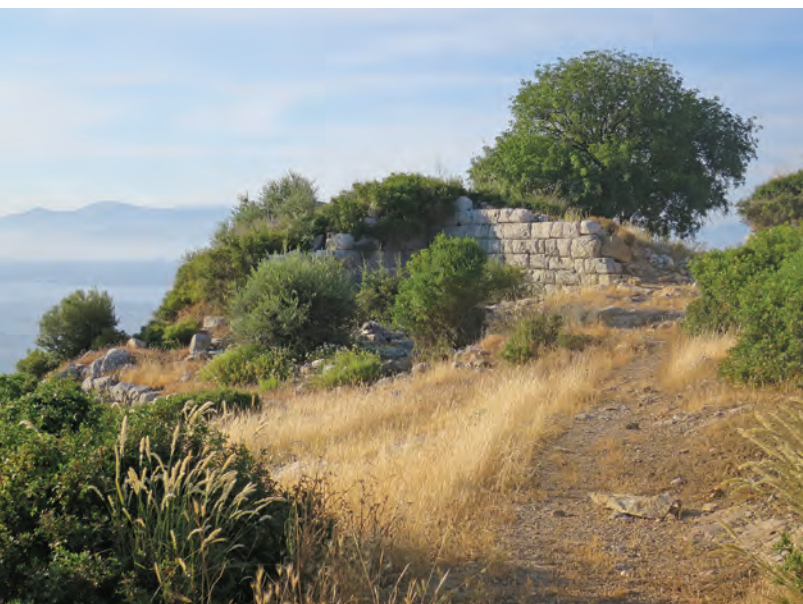
Fortifications at Notion.