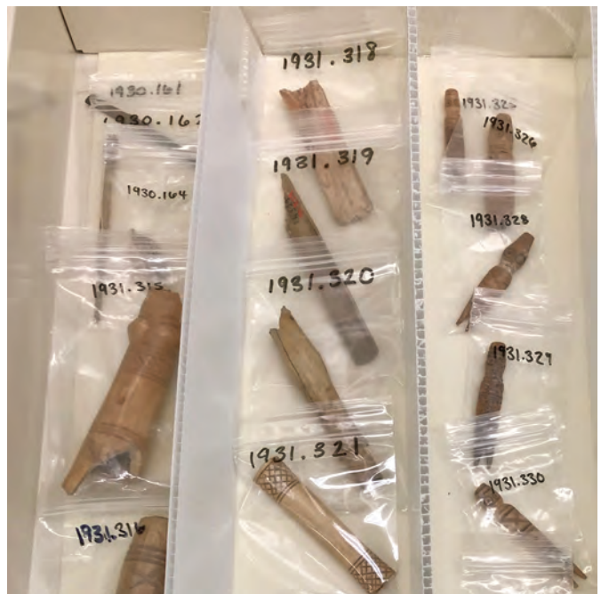
Cell phone snapshots of a few of the recently acquired objects from Seleucia.