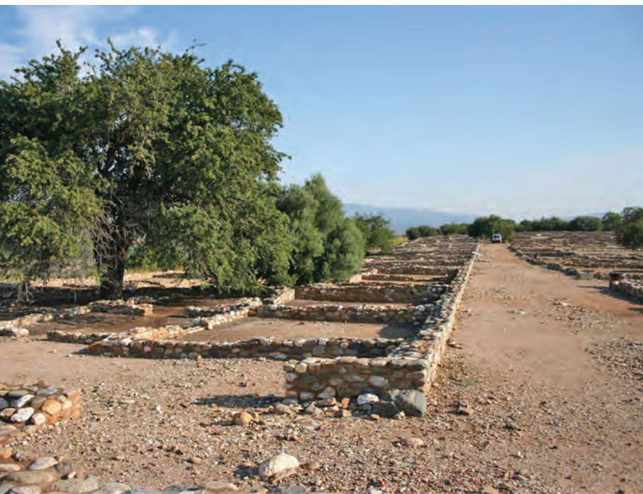
Olynthos North Hill, excavated 1928–38 and now restored for visitors.