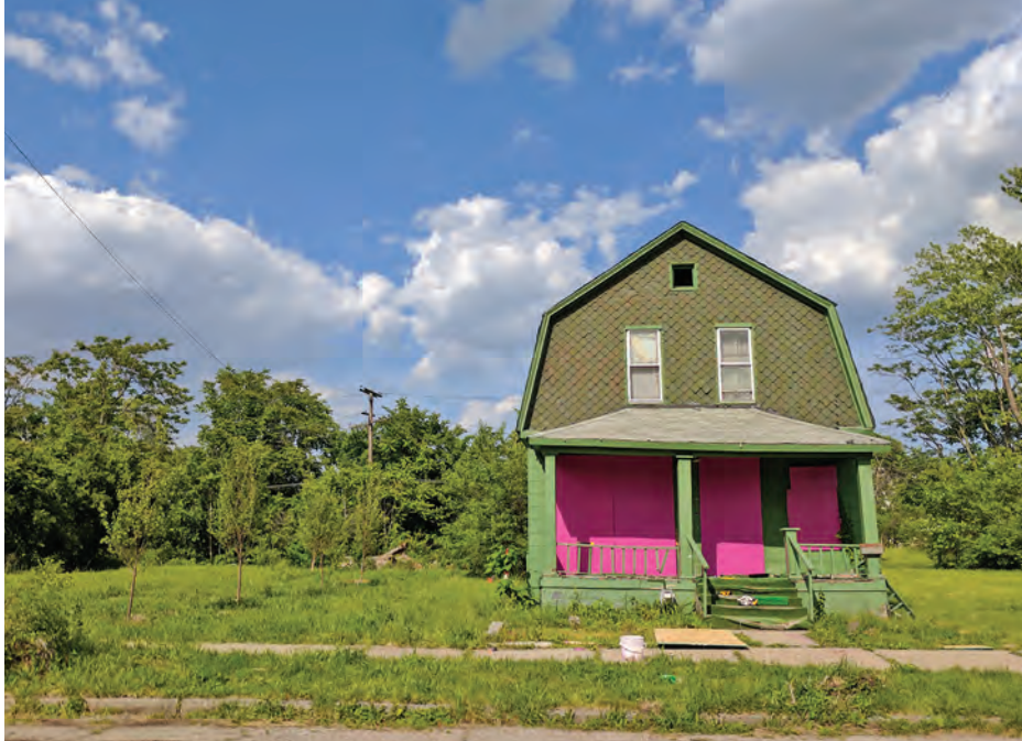
Oakland Avenue Urban Farm, Detroit.

At a more conceptual level, the exhibition tries to show that a comparative perspective, which looks at the present in the light of the past, can help the people who live in and care about Detroit imagine different possibilities for its future. Detroit is in some ways a prisoner of expectations. It does not conform to normative models of contemporary urbanism, so efforts to diagnose its “ills” have often focused on where it “went wrong” and how it can be put “back on track.” The flaws in this view were the subject of a controversial New York Times column by Paul Krugman in 2013 (“Detroit, the New Greece”), which reminded readers that while Detroit’s recent fiscal woes were dramatic, the fortunes of cities have waxed and waned through the ages, often as a result of economic forces over which the cities in question have little control. What these cities can do, however, is