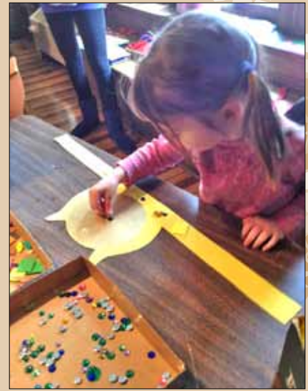
This young Family Day enthusiast begins to assemble a Hathor headdress out of colored paper and shiny beads.