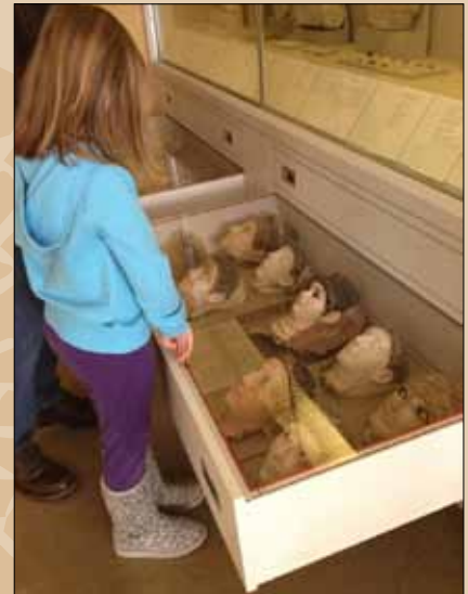
Another Family Day visitor pulls out a drawer in the Upjohn Wing to explore an array of mummy masks from Roman Egypt.